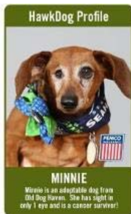
Minnie Senior Dachshund