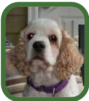
Trixie Senior Cocker Spaniel

We are a network of private homes helping Western Washington's homeless senior dogs. Old Dog Haven has no shelter or kennel, all our dogs live as members of a family. We are caring for over 240 dogs at a time in our foster homes. We focus on the oldest dogs left at shelters but occasionally we can take a dog directly from the owner. Dogs in good health with reasonable life expectancy are adopted out; the rest are loved and cared for in a Final Refuge home for as long as they have good quality of life. We also try to assist owners to find new homes for their senior dogs through our website and referrals, and cross-post senior dogs for shelters and other rescues. Old Dog Haven is a 501(c)(3) non-profit organization. Please explore the website for information about becoming an ODH home, adoptable dogs, our placement program, sponsorship program for Final Refuge dogs, and other resources. Some of our dogs for adoption: